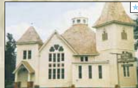
Zion Hill Baptist Church (1914) 324 North Lanana

Victorian features of this church are scrollwork in porch gables and window headings, cupola, steeple tower, and also towers above the north and south entrances. The cupola and three towers have knob and spire finials.